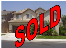
4 / 3 Picture perfect!