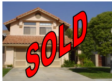
3 / 2.5 Turnkey!