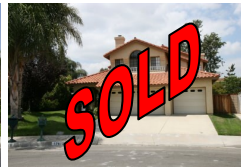
4 / 3 Bonus room!