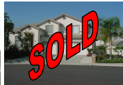
4 / 3 RV Parking!