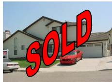
3 / 2.5 Turnkey!