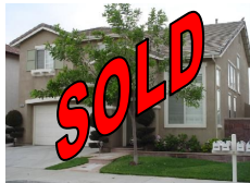
3 / 2.5 Stunning!