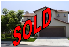
4 / 2.5 Great floor plan!