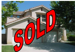
5 / 3 Pool & Spa, View!